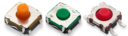
Figure 1: KSC DCT, KSC2 DCT, and TLSM Series

In an automotive door handle as an example, both NC and NO circuitries are used before making any decision. The logic is at rest, the NC contact is closed while the NO contact is open. When a user pushes the button, nothing will happen until the NC contact is opened, and the NO contact is closed. See below table, this gives the customer only one logic for correct execution, and the other three are malfunctions.